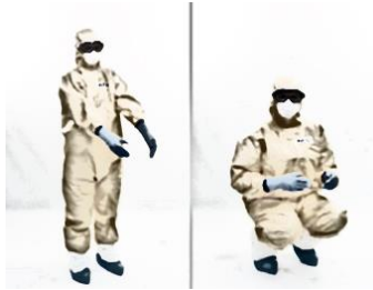
USE AIR TIGHT GOGGLES