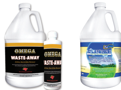
Waste-Away Urine, Stain, & Odor Remover ProFresh Deodorizer